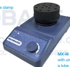
MX-M with universal top plate and a tube adapter