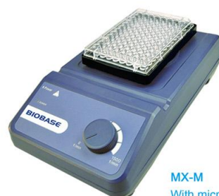
MX-M With microplate clamp